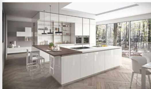
Inner Design 269