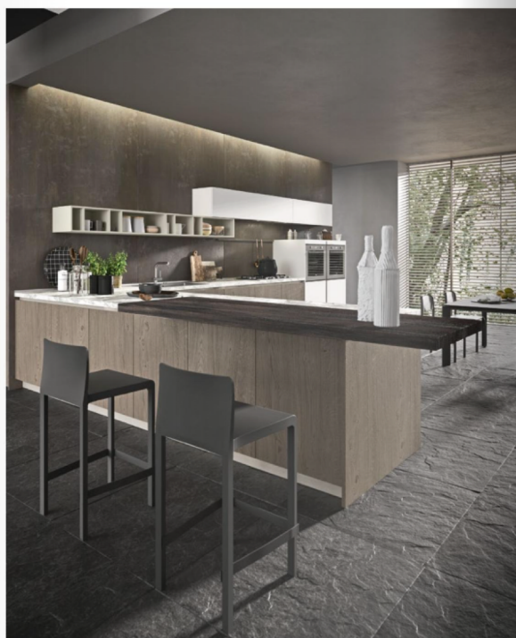
268 Inner Design