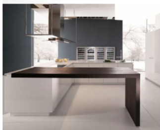
256 Inner Design

tall units and accessories cabinets, are crucial to place all the necessary in the kitchen but are also perfect in the living area. ➤