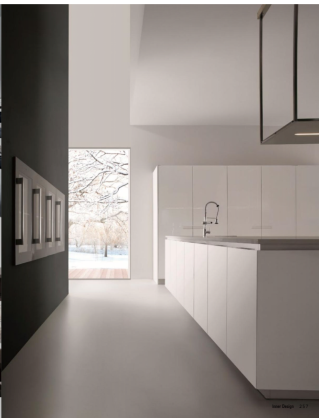
Inner Design 257